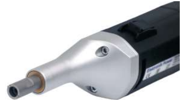
Autopsy saw, standard

This procedure is done so quickly, that the user won't recognize any difference. Therefore the plaster saw offers an optimised number of oscillations during use. In case of excessive use of the motor (e.g. if saw blades are stuck) the electronic system switches off the saw. The saw can be re-used after a short break.