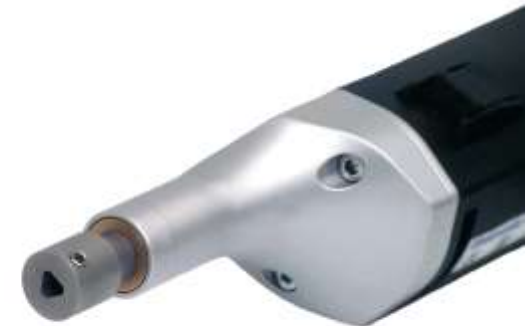
Autopsy saw, special tringle chuck